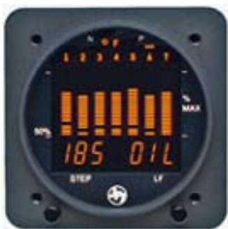
Oil Temperature Mode

A complete engine data recording system. Capable of recording not only EGT and CHT as some less sophisticated systems do, but also can record all 24 engine temperatures, plus all engine pressures, RPM and can calculate percent of horsepower. The ability to print out alarm conditions, with three dimensional color data analysis of your computer, is also a feature.