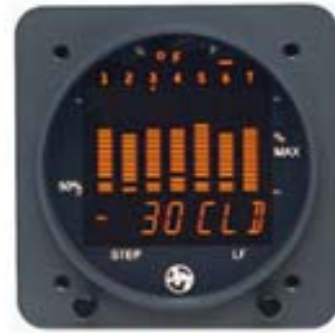
Shock Cooling Mode

peak is detected. The display will also then flash the cylinder column and show peak EGT. The pilot has the option to increase (the richness of the mixture) or operate at peak. Leaning faster than the engine can respond will cause the display to flash "2 FAST." The EDM is monitoring all alarms in the background and if the TIT limit is exceeded during the Lean Find process, the TIT column will flash first. Some turbocharged engines do peak TIT before the EGT peaks.